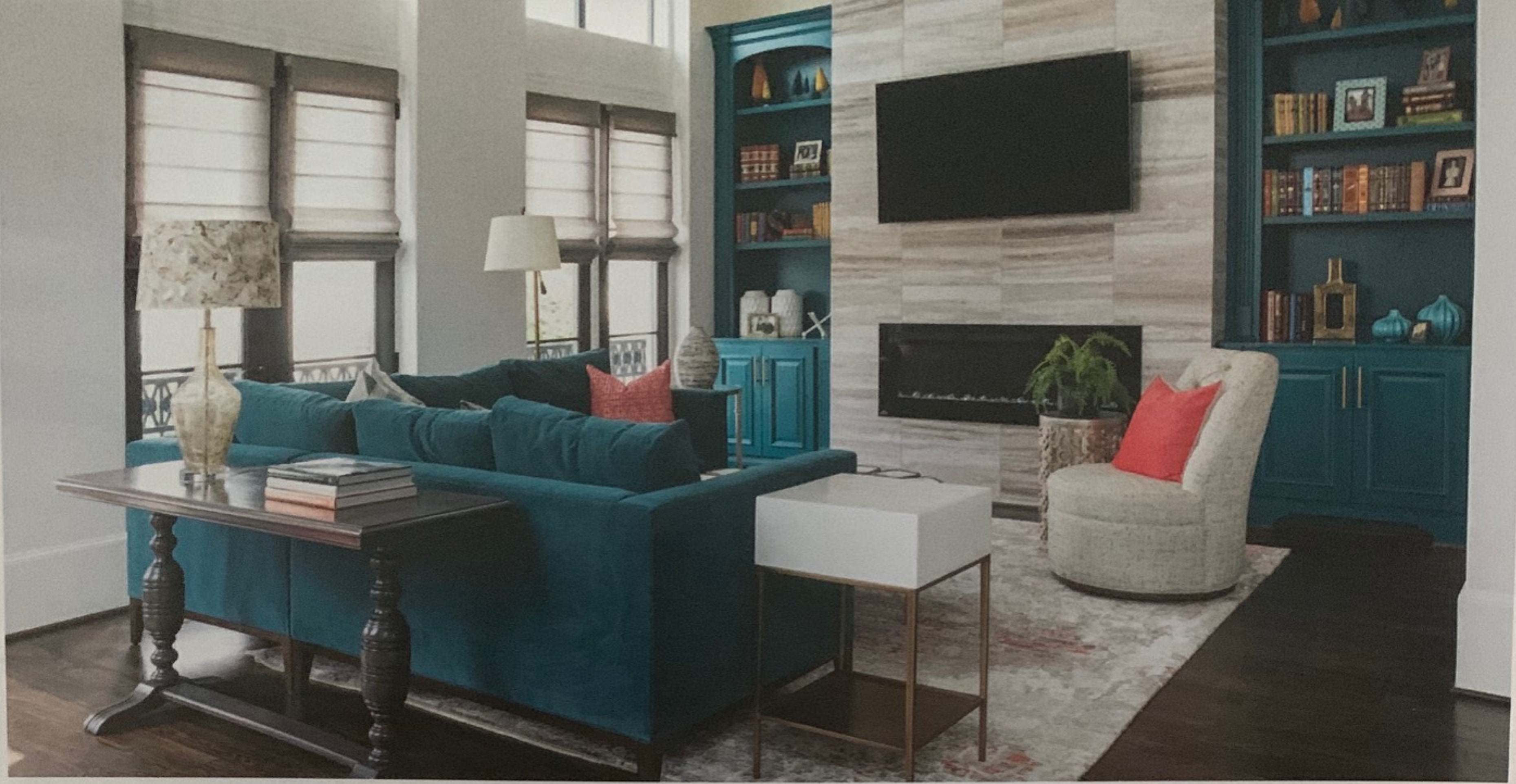
[Above] The vibrant living area features teal painted bookcases and a stone fireplace. [Right] The bar area of the kitchen has brass pulls, a marble backsplash and countertop, and neutral grey cabinets.